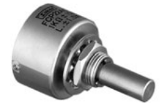
Model FCP22AC (Metal Housing)